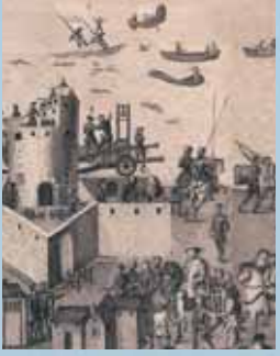
Sinking of the Mary Rose

The Mary Rose was built at about the time that Henry VIII came to the throne (1509) and was one of the first ships able to fire a broadside. She was a firm favourite of his and took part in most of his wars. She was raised in 1982, and is the only 16th C warship on display anywhere in the world.