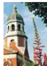
Royal Victoria Country Park

Public Transport: Hill Head First, 33, 35 - 023 9286 2412