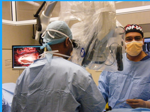
UK's Most Advanced Neurosurgical Microscope

Our most recent appeal has seen one of the Centre's operating theatres equipped with the first UK installation of a new generation of a state-of-the-art neurosurgical operating microscope fitted with Fluorescence Imaging technology, a system that provides surgeons with real-time images of blood-flow in the brain during neurovascular surgery, such as for the clipping of aneurysms.