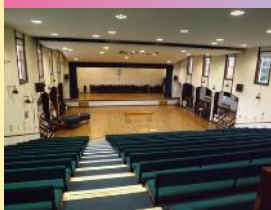
Oaklands School Hall

Both orchestras have a solid reputation for high quality performances with outstanding soloists, including familiar local musicians, up-and-coming new talent and established international performers.